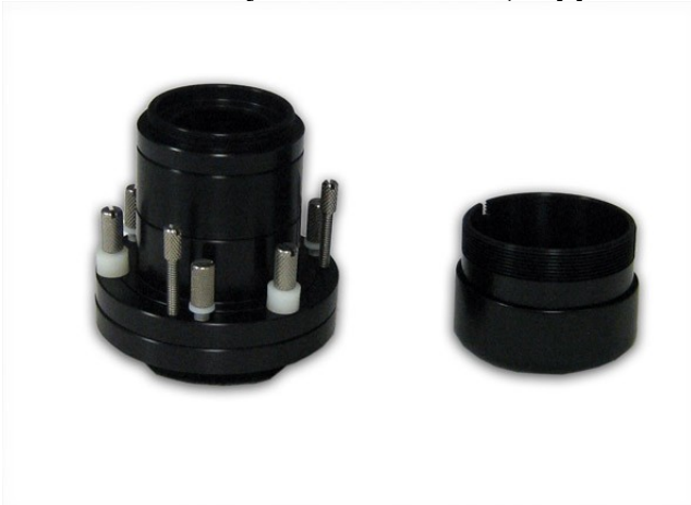
HyperStar lens and secondary mirror holder